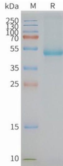
Figure2. Human SLC7A11-Nanodisc, Flag Tag on SDS-PAGE