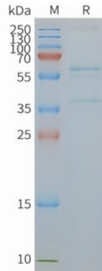
Figure2. Human SLC2A4-Nanodisc, Flag Tag on SDS-PAGE