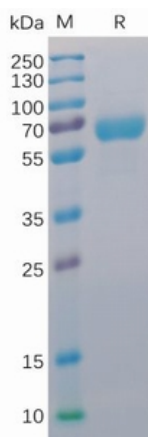
Figure 1. Human CD48 Protein, mFc-His Tag on SDS–PAGE under reducing condition.

储存和运输: Store at –20°C to –80°C for 12 months in lyophilized form. After reconstitution, if not intended for use within a month, aliquot and store at –80°C (Avoid repeated freezing and thawing). Lyophilized proteins are shipped at ambient temperature.