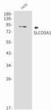
Western blot analysis of SLCO5A1 in T47D lysates using SLCO5A1 antibody.