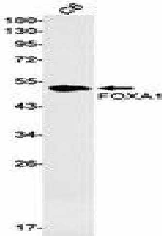
Western blot analysis of FOXA1 in C6 lysates using FOXA1 antibody.