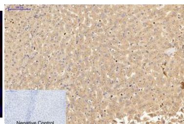
Immunohistochemistry analysis of paraffin-embedded Human liver tissue using Carcino Embryonic Antigen CEA (2A8) antibody. High-pressure and temperature Sodium Citrate pH 6.0 was used for antigen retrieval. Negative control was used by secondary antibody only.